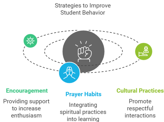
Figure 2. Strategies to Improve Student Behavior

Teachers also motivate students in various ways, such as encouraging when students seem less enthusiastic, getting used to praying before and after learning, and cultivating greetings and polite behavior. However, this implementation still faces challenges. For example, although some students are used to saying greetings and using courteous language, this habit is not entirely evenly distributed among students.